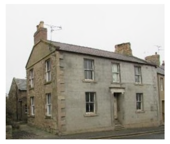
High Street, Coldstream

As an example, SBC supported work at a property at Chapel Street, Eyemouth lying within the town's conservation area and listed on the buildings at risk register. Guidance and specialist advice has helped the owner to progress works, and secure VAT exemptions.