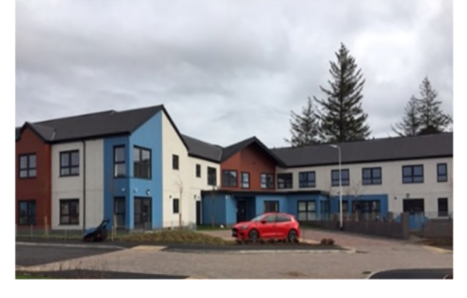
Wilkie Gardens, Galashiels