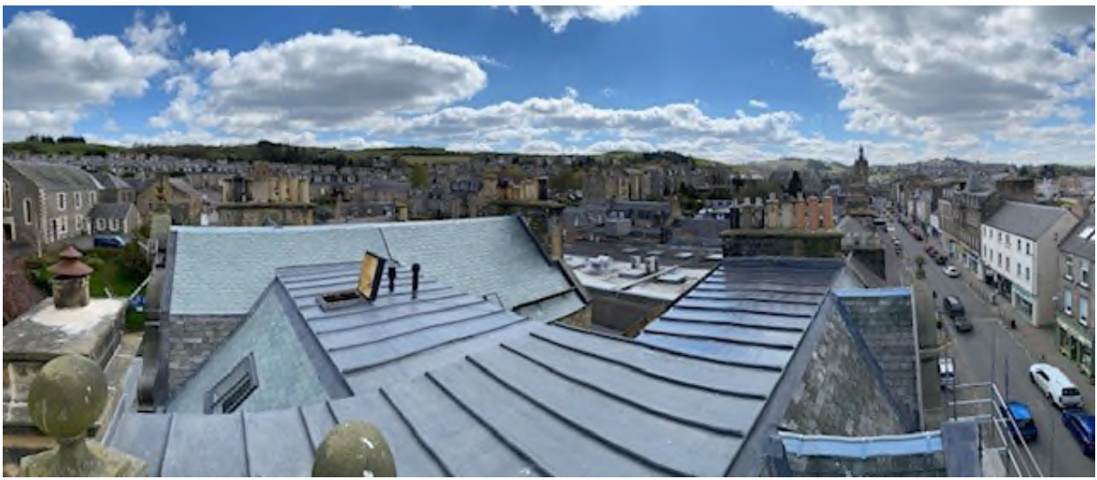
View from top of 80, High Street, Hawick