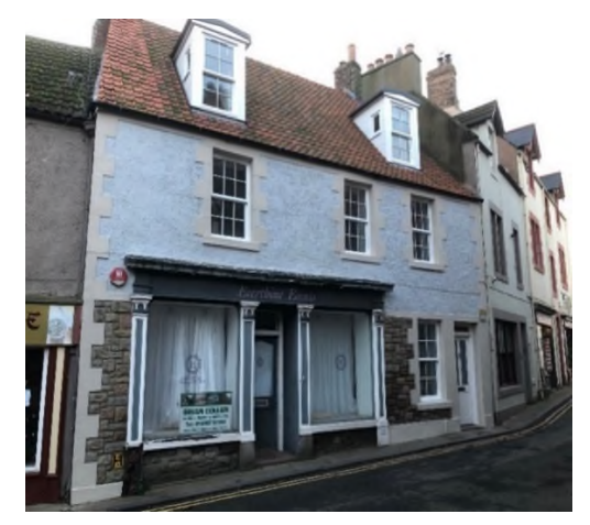
Empty Homes: Before and after shots of the exterior of a renovated empty home at Chapel Street, Eyemouth