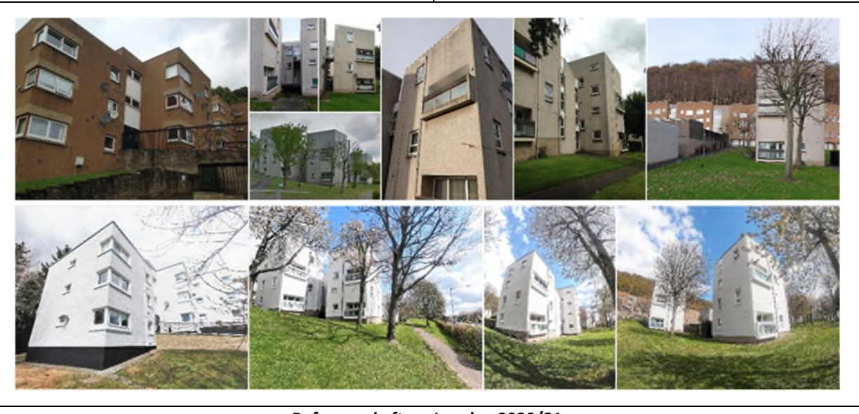
Town Yetholm 2019/20