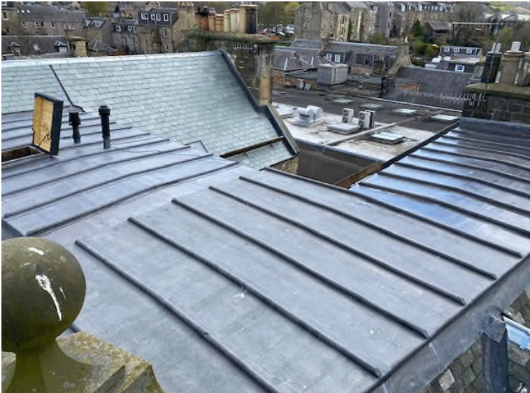
View to turret, overlooking Hawick town.

Hawick CARS were also able to offer grant funding to another priority building – Glenmac Mill, Hawick. This work was due to start in April 2023 and due for completion Autumn 2023 to tie in with the flood protection works and the Hawick CARS public realm project currently being developed with the appointed external consultants and funded by the heritage scheme.