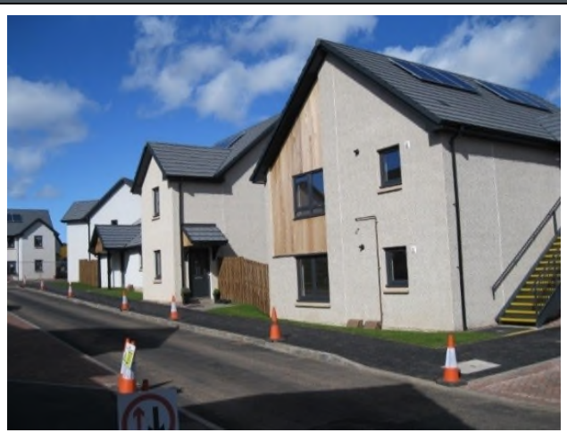
Sergeants Park, Newtown St Boswells 2018/19