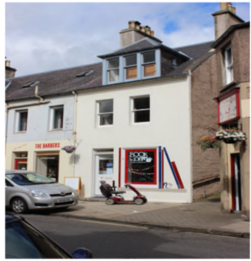
59 High Street, Selkirk - Before CARS work and After

Selkirk CARS focused on a range of heritage and conservation-based regeneration activities within the town, the centrepiece being repairs to the Sir Walter Scott Courthouse steeple, weather vane, clock faces and high level stonework.