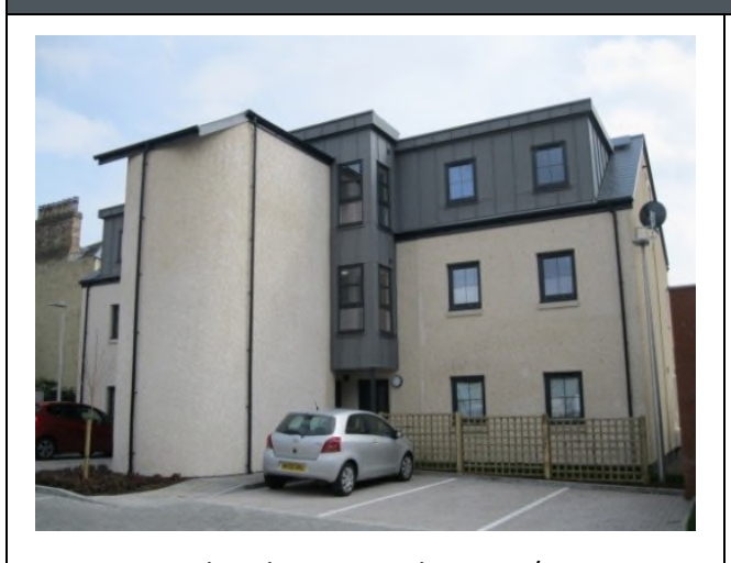
Roxburgh Street, Kelso 2017/18