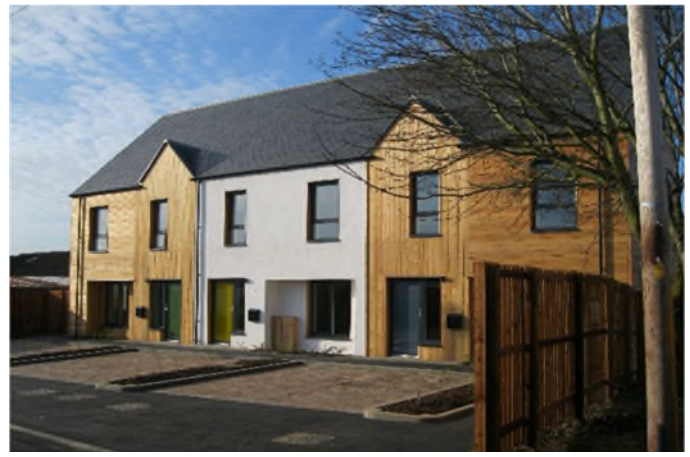
Passivhaus Development, St Boswells

Four of Eildon's affordable housing projects have been selected for inclusion in the Pilot, which will involve the design, development and delivery of around 30 homes, using three different energy efficient solutions such as Passivhaus, Energiesprong and off-site construction/volumetric design, alongside a 12