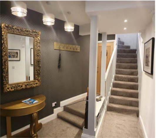
Before and after shots of the interior at Chapel Street, Eyemouth

Scottish Borders Council appointed a dedicated Empty Homes Officer in August of 2021, who currently has an active case load of 182 empty homes. Over the last 18 months the Empty Homes Officer has been making connections with owners, neighbours and communities being affected by empty homes.