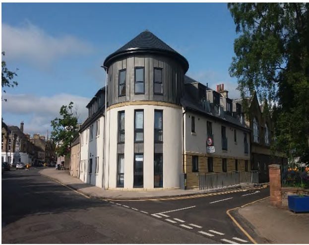
121-123 High Street, Selkirk

SBC officers were involved in a property at High Street, Coldstream, where officer's guidance and specialist advice helped an owner to progress works and secure VAT exemptions. Support was also provided to assist the owner's application for the rural housing fund, with the intention of assisting the owner with bridging any funding deficit in the renovation of the listed property bringing it back into use.