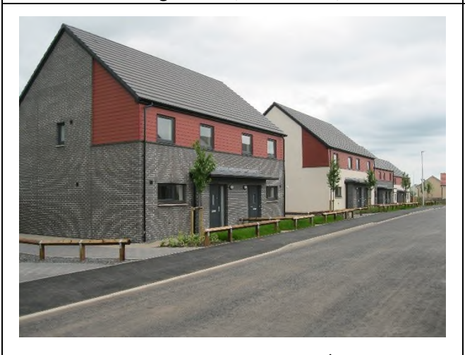
The Glebe, Chirnside 2019/20